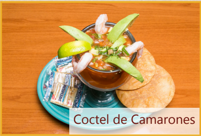
Coctel de Camarones

large, cooked shrimp in a cocktail bowl with onions, tomatoes, cilantro, cucumber and avocado. Served with tostadas and saltine crackers 19