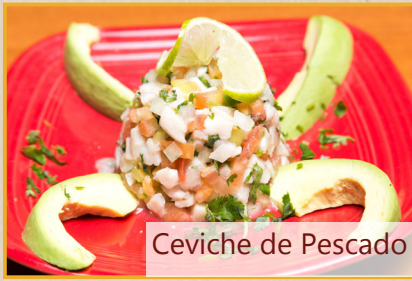
Ceviche de Pescado

Cooked tilapia fish or shrimp marinated with lime juice and pico de gallo topped with slices of avocado. Served with tostadas and saltine crackers 15